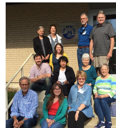
Mission Volunteer training, 2018

This is accomplished through serving as a resource to Conference UMVIM and Disaster Response Coordinators and to establish and promote project sites in the United States at the invitation of the United Methodist Conference in which each project resides, and to train United Methodists to be leaders in missional connection.