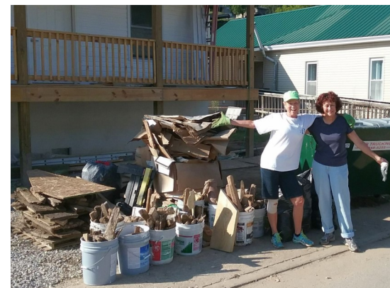
West Virginia, 2018